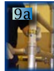
Interlock Clip unlocked