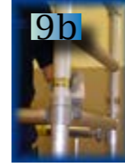
Interlock Clip locked