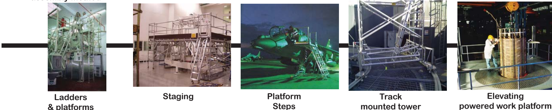
Ladders & platforms