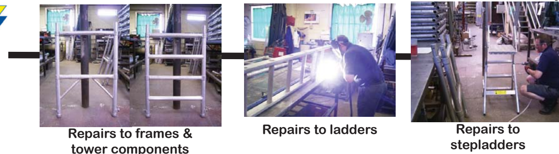
Repairs to frames & tower components