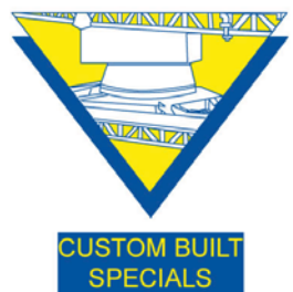
CUSTOM BUILT SPECIALS