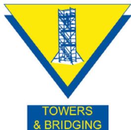
TOWERS & BRIDGING