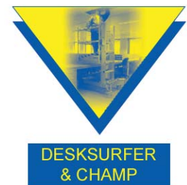
DEKSURFER & CHAMP